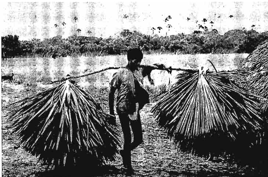
FIG. 2.—Pumé man returning to community with M. flexuosa fronds to be used in house thatching.

lected for thatch then the heart is usually taken as well. Rhynchophorus larvae are collected from the rotten stems of M. flexuosa cut in previous years to obtain thatch; however, I have no indication the Pumé actively create habitats for Rhynchophorus by cutting palms for that purpose alone. There are no good natural substitutes in the interfluvial zones occupied by čiri kʰonome Pumé for the thatch and fiber produced from M. flexuosa . The bea kʰonome Pumé living along major rivers in the region such as the Capanaparo, Cinaruco and Riecito use M. flexuosa for thatching, but Astrocaryum jauari (Palmae) is commonly substituted for fiber. While commercial substitutes for thatch and fiber can be obtained this depends on the availability of cash, which is still a rare commodity among the Pumé (both čiri kʰonome and bea kʰonome ) in this area of Venezuela. Zinc roofing sheets, for example, are expensive for the Pumé (each sheet is equivalent to about two weeks fulltime labor), difficult to transport and ultimately less comfortable to live under than palm thatch in this environment.