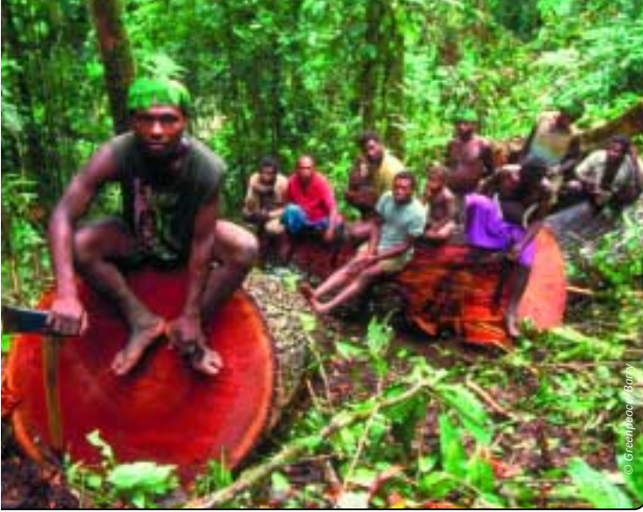
Community Eco-Forestry Team at the end of a long day, West New Britain, Papua New Guinea - eco-forestry is a growing enterprise in Papua New Guinea