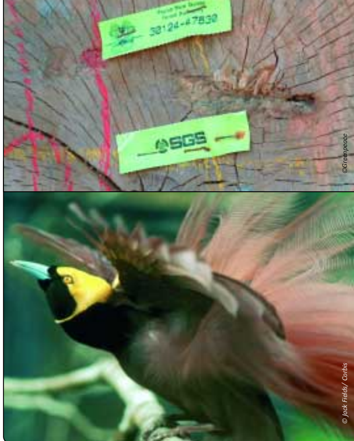
The bird of paradise, Papua New Guinea's national emblem, seen depicted on a log tag in Zhang Jia Gang port in China and in its natural habitat - ironically, forest product exports to China and elsewhere are destroying the bird's habitat and threatening Papua New Guinea's economic security and social stability

The Paradise Forests of Papua New Guinea are among the largest and most biologically diverse ancient forests left in the world. The future of these forests, and of the people who depend upon them, is currently at the mercy of an international market whose voracious appetite for cheap timber, furniture and flooring is driving ancient forest destruction. This market, led in Papua New Guinea's case by China's huge demand for raw material for furniture manufacture, turns a blind eye to the human and environmental devastation it is causing. Many of the transnational logging companies that currently dominate Papua New Guinea's forestry industry have moved to these forests after depleting rich forests nearer to home. They come with appalling corporate, environmental and social records. Unsurprisingly, their record to date in Papua New Guinea is no better: promises to local communities are broken while the forest around them is destroyed and good governance is undermined. This report profiles the scandalous Kiunga-Aiambak Road Project as one example of what is going wrong in Papua New Guinea's forests. It also provides a lens through which to examine the impact on those forests of the international trade in furniture, flooring, cheap plywood and other wood products.