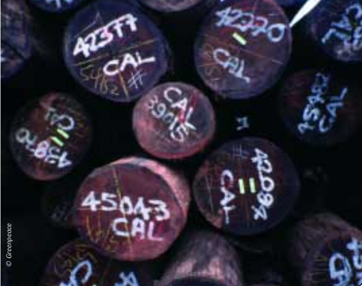
Logs from the Malaysian-owned company Concord Pacific exported from Papua New Guinea to China