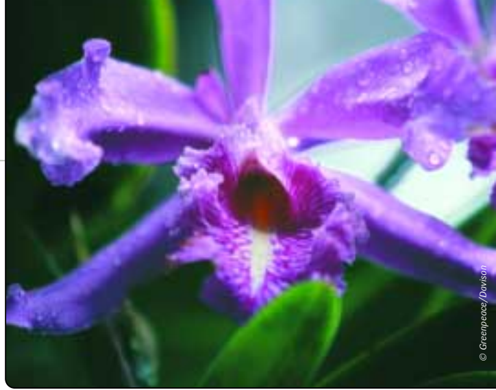
Papua New Guinea's forests have a plant diversity among the highest in the world, with over 15,000 species, including the greatest diversity of orchids on earth