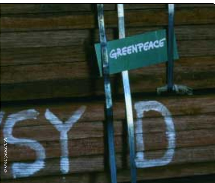
A shipment of community-produced eco-timber from a Greenpeace-supported project in the Solomon Islands - by specifying products certified by the Forest Stewardship Council, consumers can be part of the solution rather than the problem

Despite its problems, Papua New Guinea presents a unique opportunity to set a global example in effecting such a turnaround. More than 95% of its area is privately held under customary ancestral land tenure, which is upheld by the country's constitution, and cannot be alienated or sold. Moreover, half of the country's ancient forests still remain unallocated in large tracts. The country also boasts a greater diversity of intact, largely self-reliant subsistence cultures than anywhere on earth, a relatively independent judiciary, a free press and some extraordinary and visionary leaders. Given these circumstances there is a real chance to develop an alternative future for Papua New Guinea – and to achieve genuine community-centred forest conservation and sustainable forest use. The result would be the protection of more than 5% of the earth's terrestrial species, along with the spearheading of innovative and effective models for ecologically and socially responsible development.