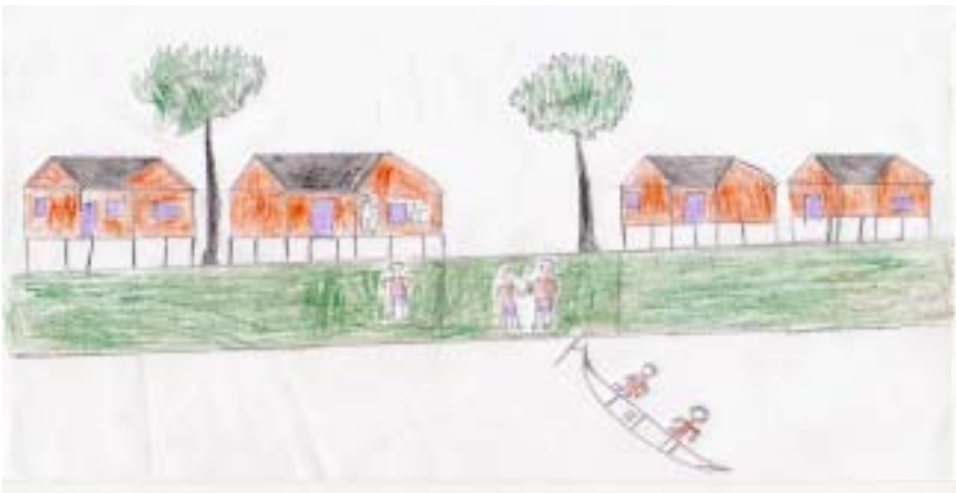
Madiha kariwadeniza aoko mitha kenahari. Sori, Iari

Naharo aldeidenizape, wada toshonikhimanani da neherani, zenihi nama zanapomanahari.